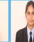
SAMPRIETHA EBACS 89%